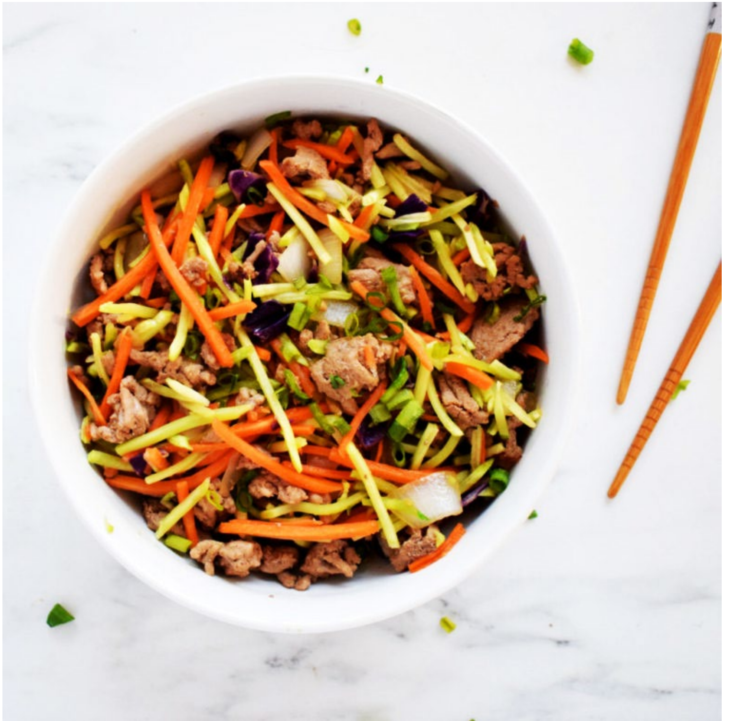
Egg Roll Bowl