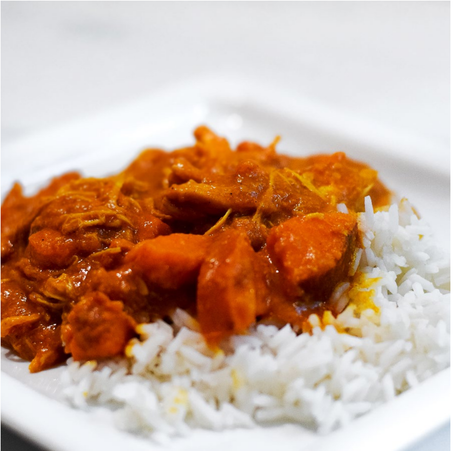
Slow Cooker Curry Cashew Chicken