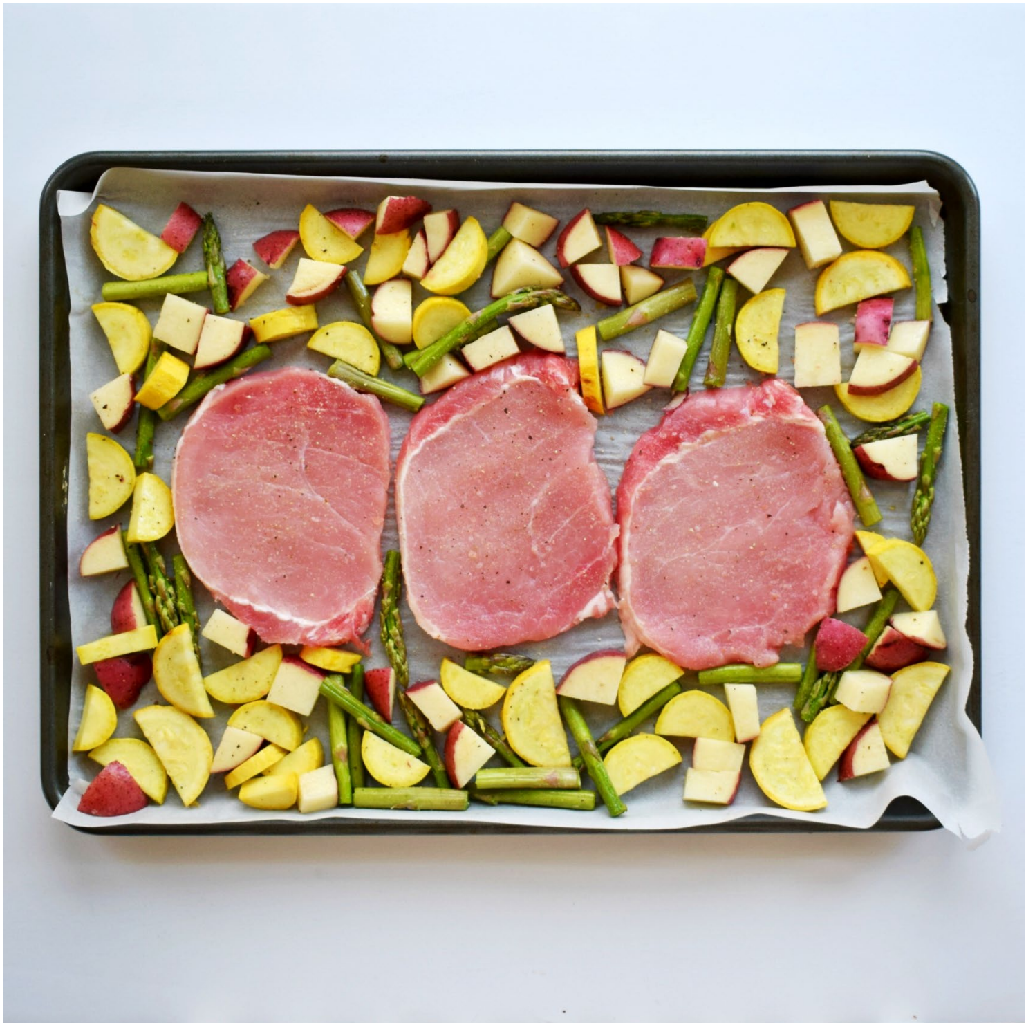
Oven Roasted Pork Chops and Veggies