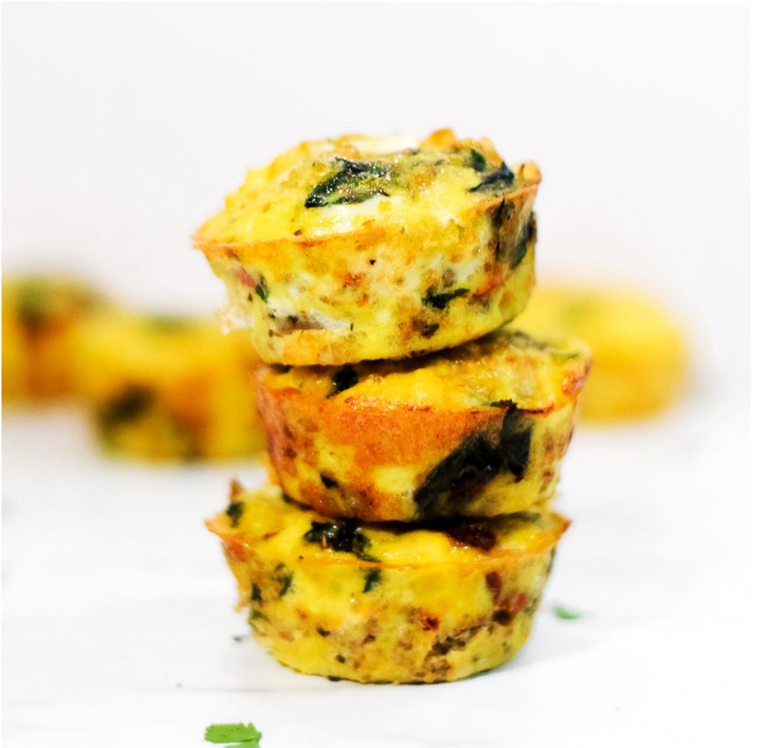
Mediterranean Egg Cups