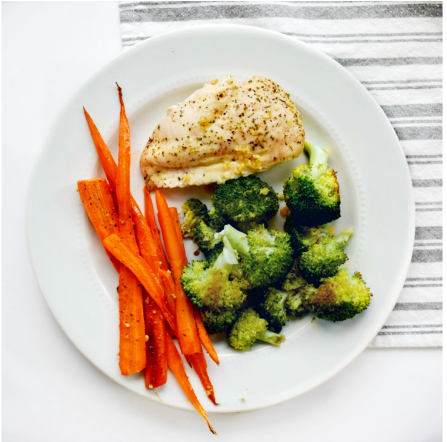
One Pan Lemon Chicken & Veggies