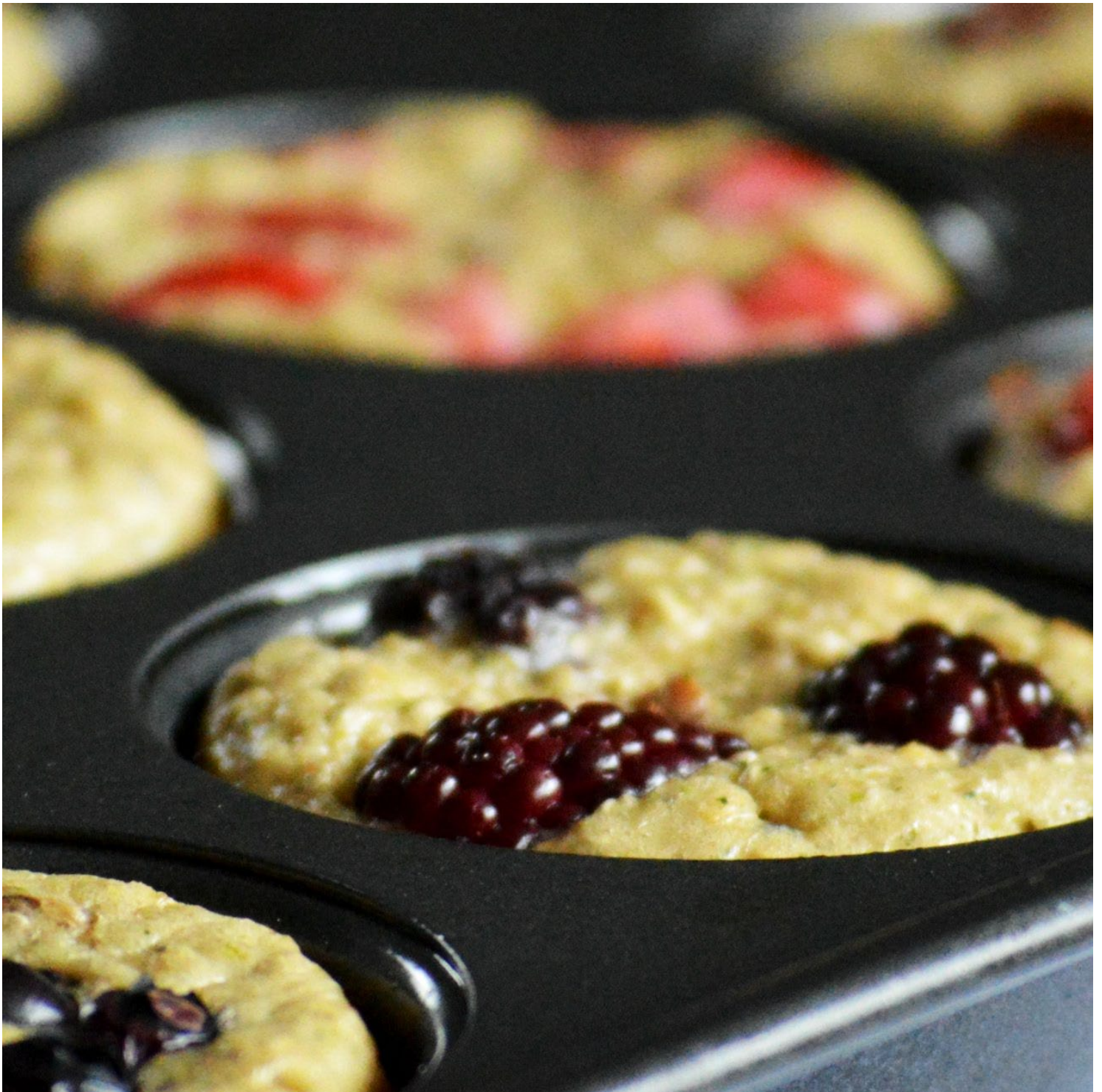
Banana Protein Muffins