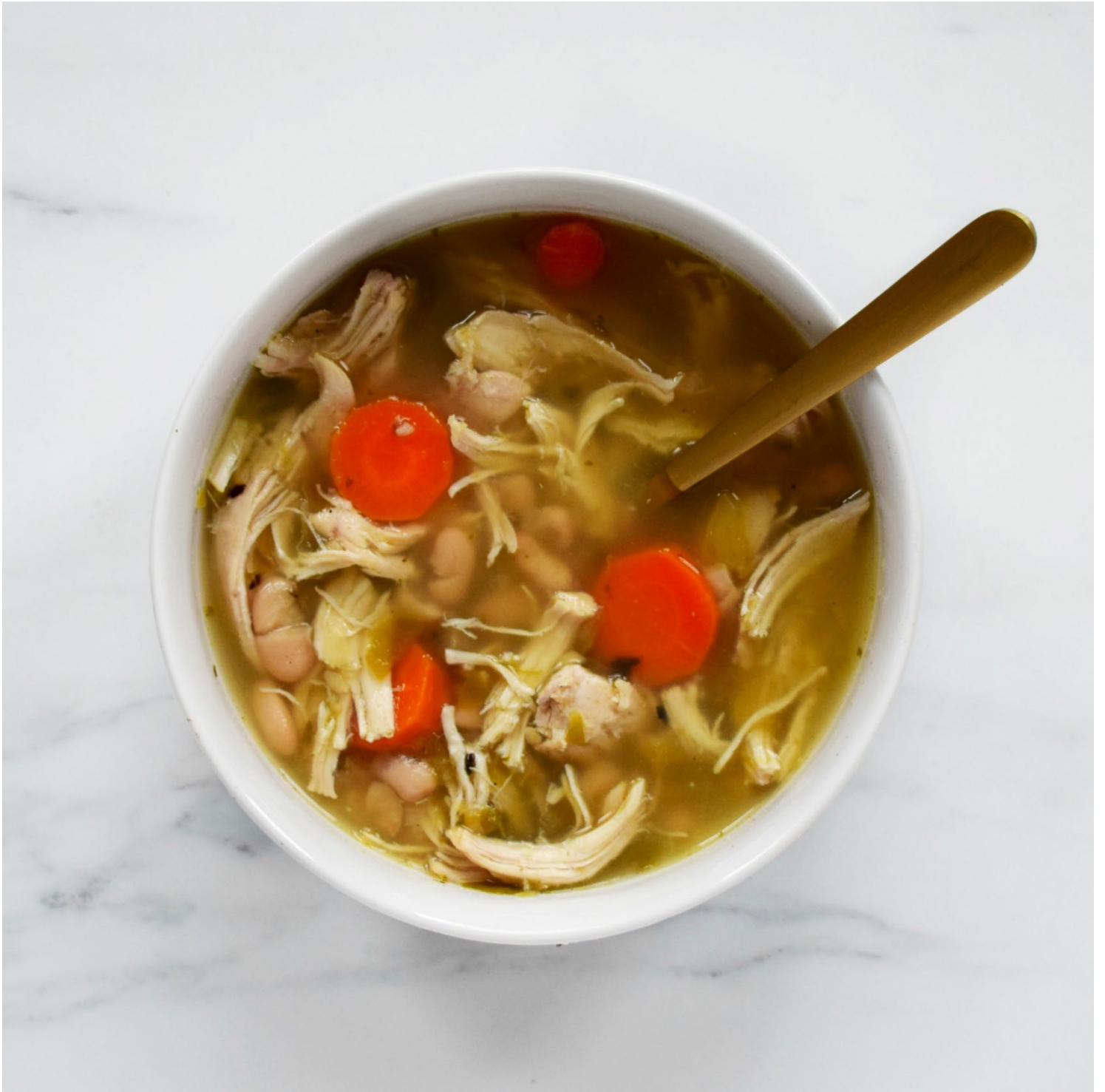
White Chicken Chili