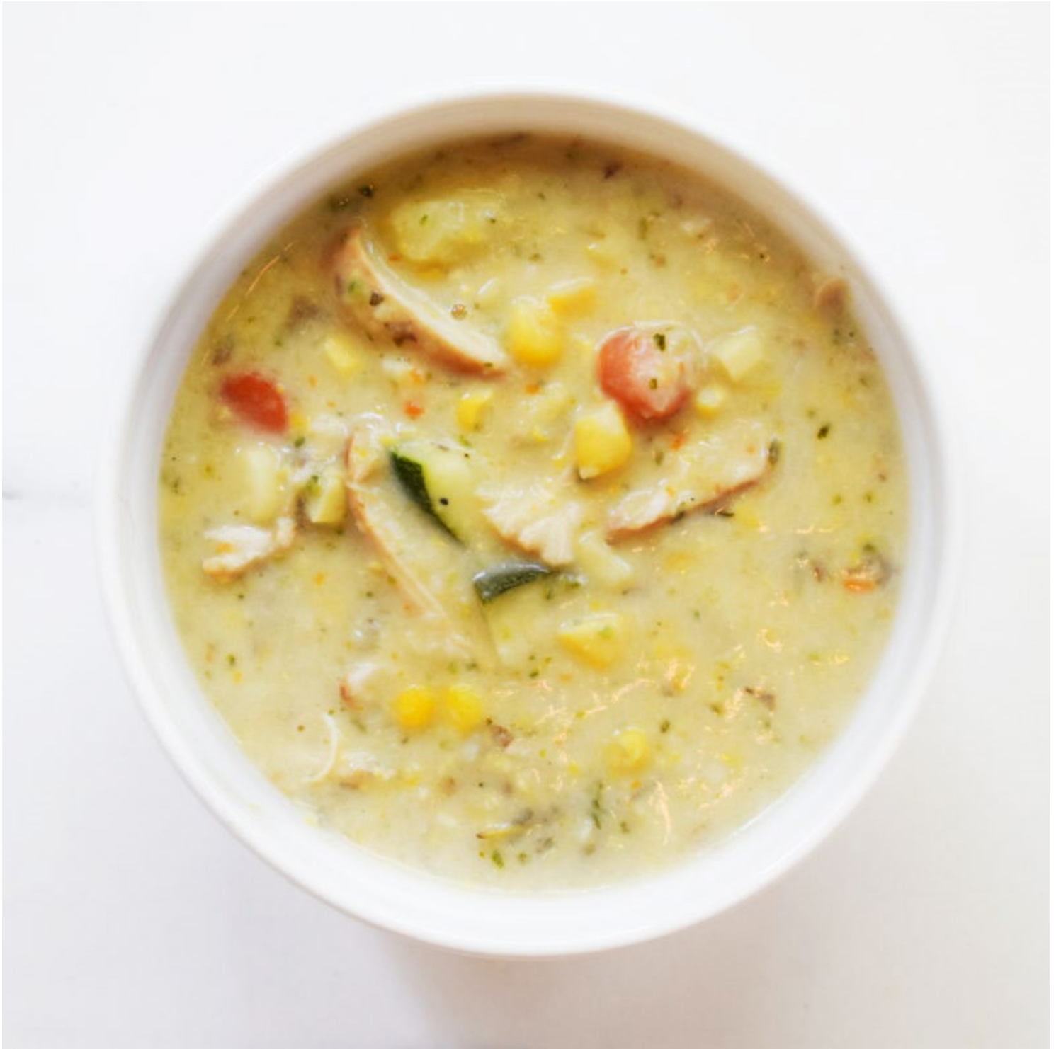
Zucchini and Corn Chowder