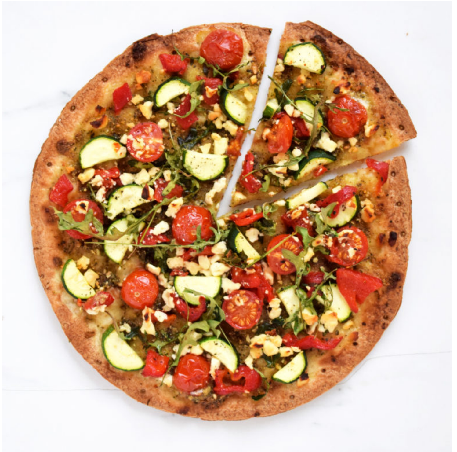
Mediterranean Cauliflower Crust Pizza