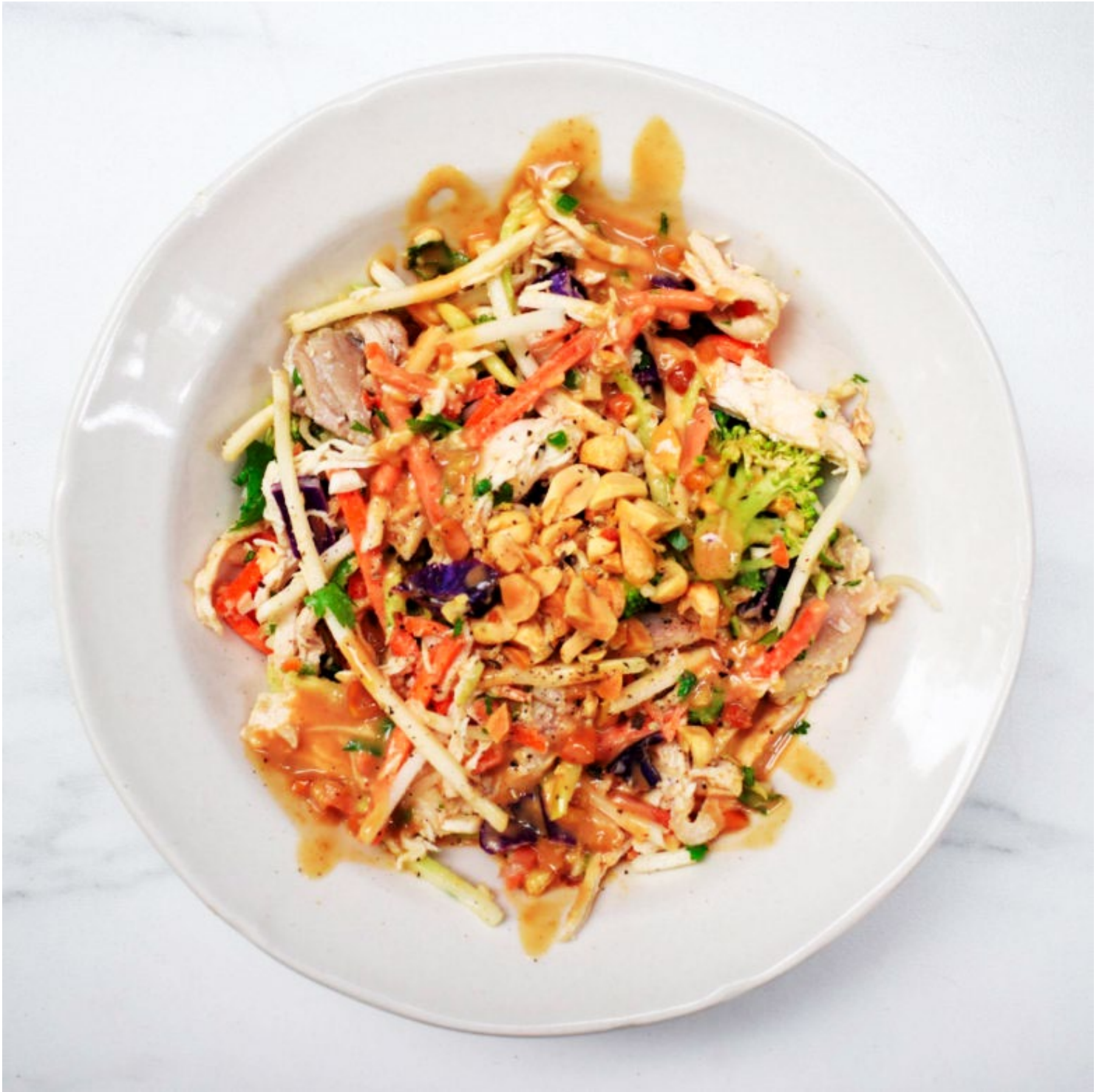
Chopped Thai Chicken Salad