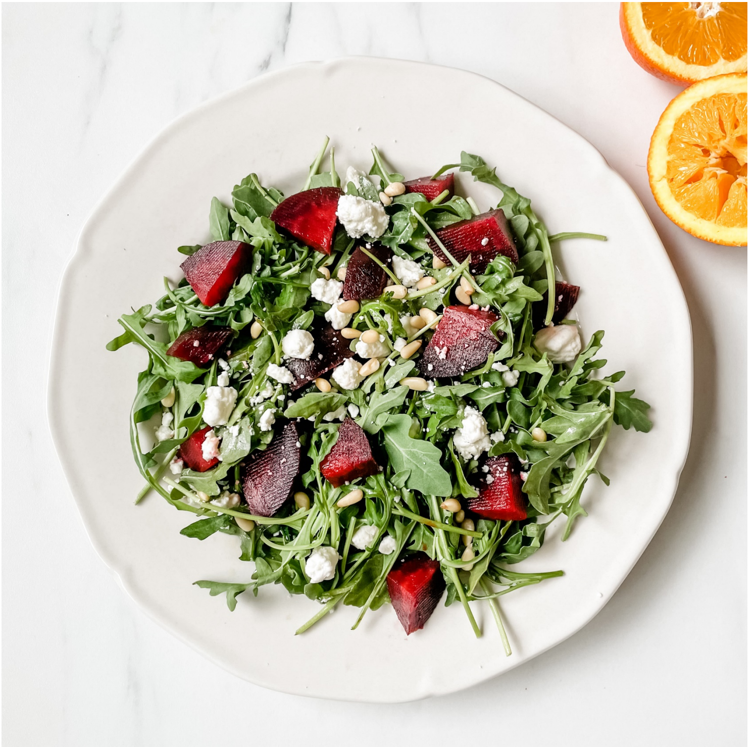
Beet and Arugula Salad