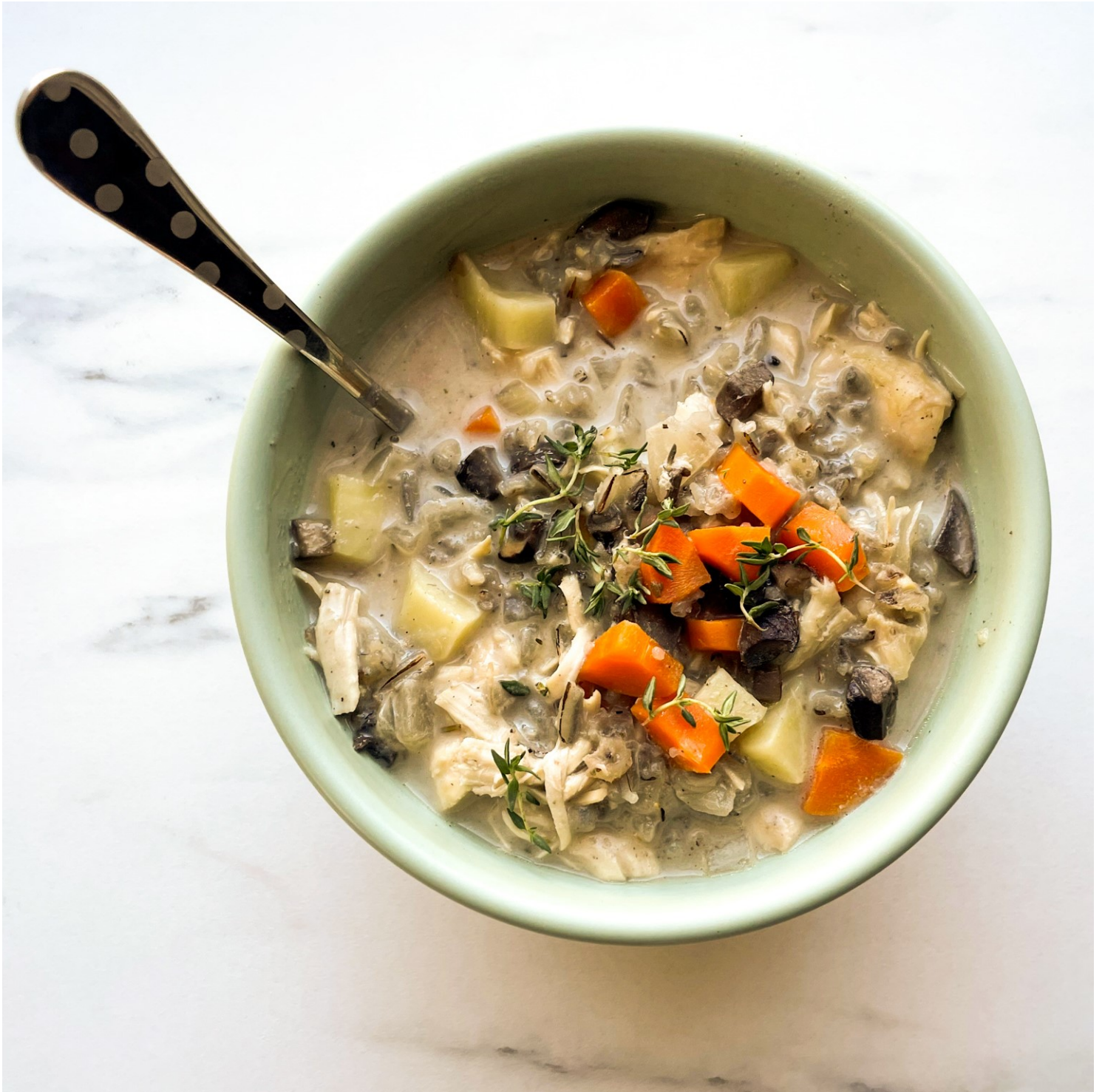
Creamy Chicken Wild Rice Soup