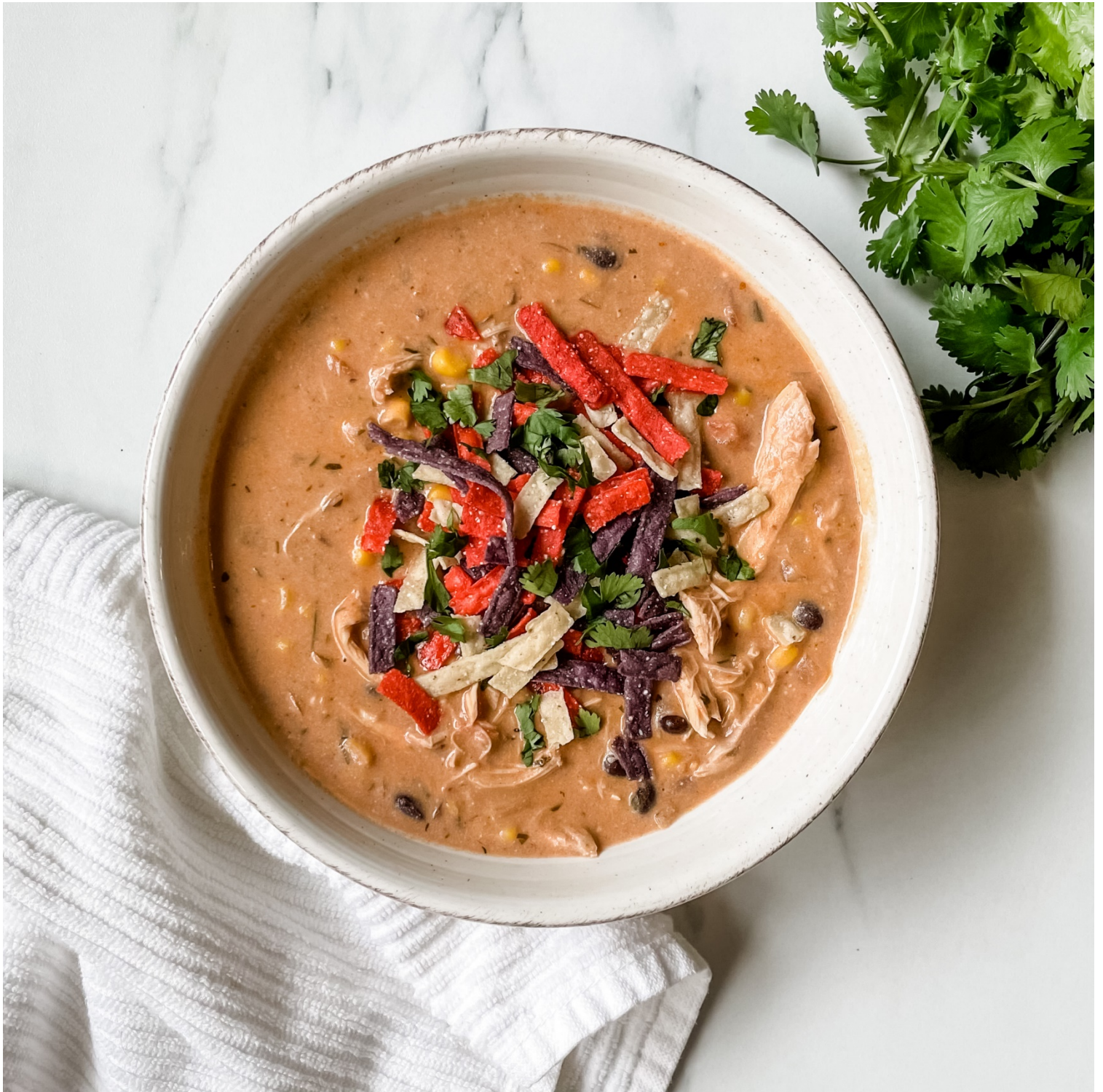
Creamy Chicken Tortilla Soup