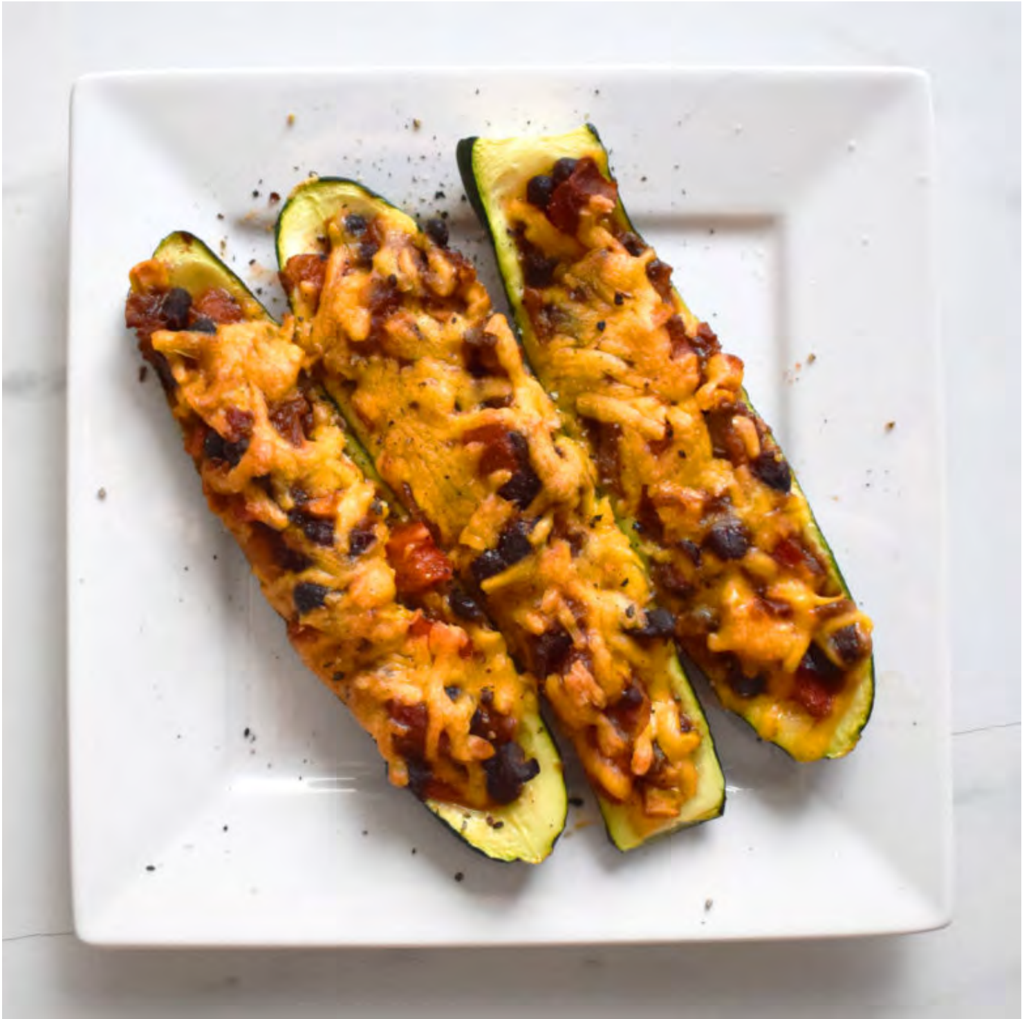
Mexican Zucchini Burrito Boats