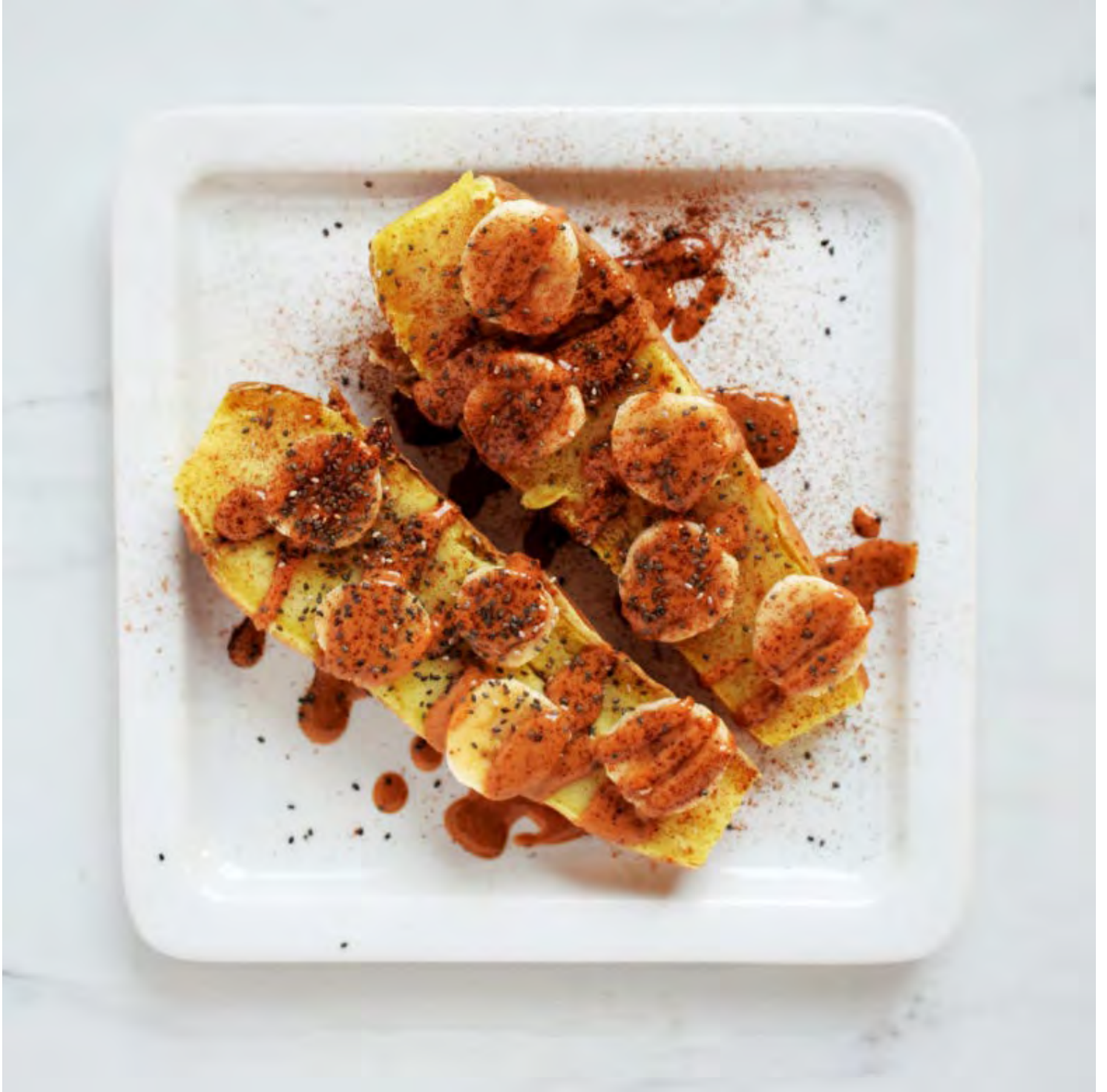
Breakfast Sweet Potato