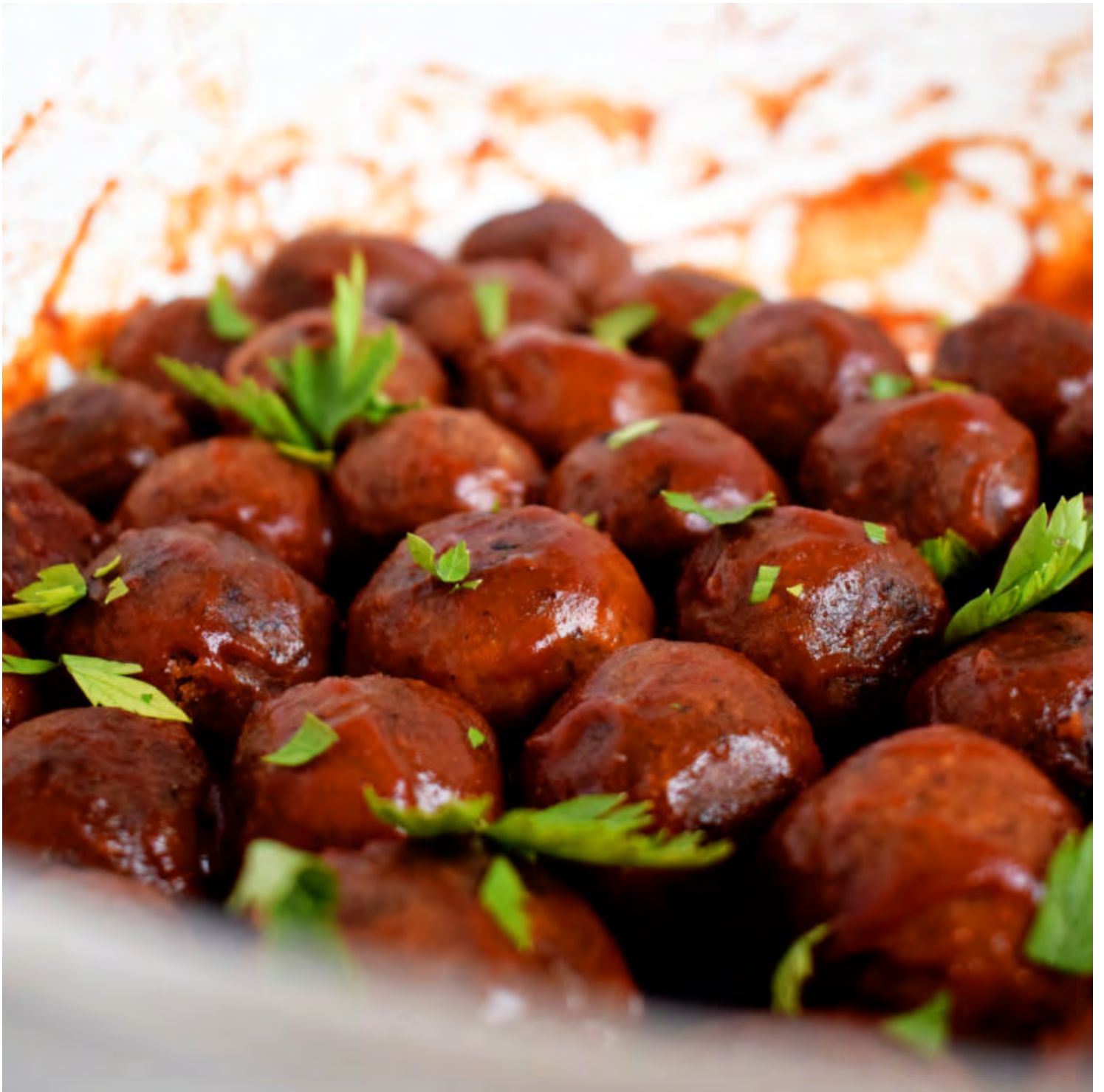
BBQ Black Bean Meatballs