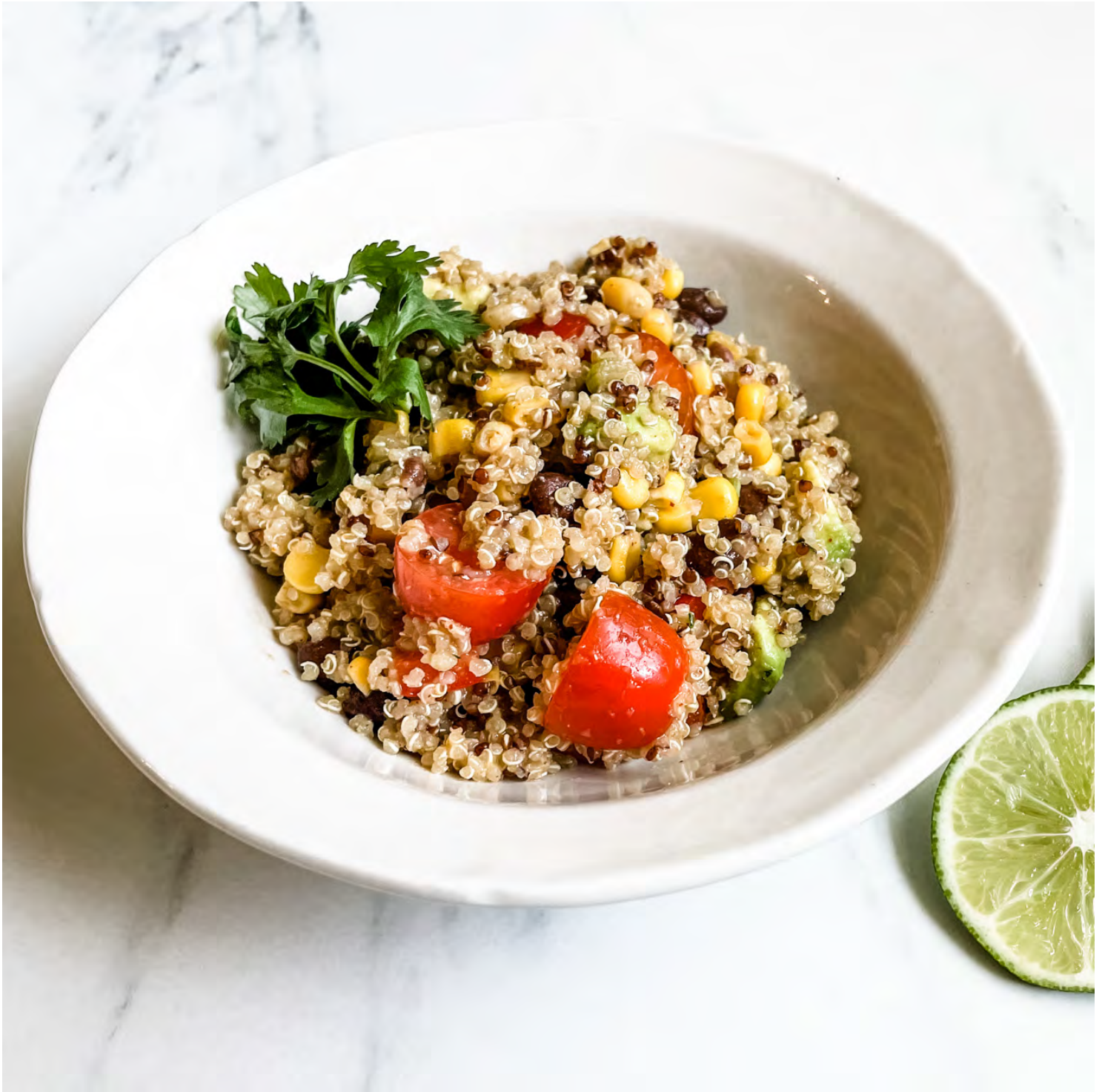
Southwest Quinoa Salad