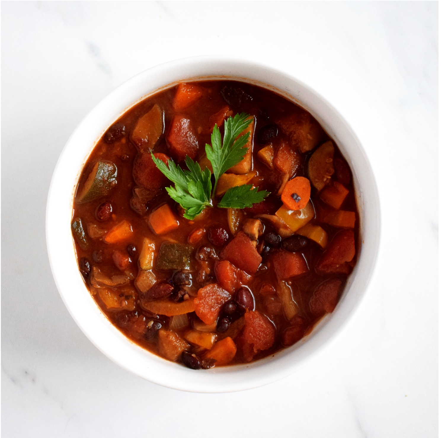
Vegetarian Rainbow Chili