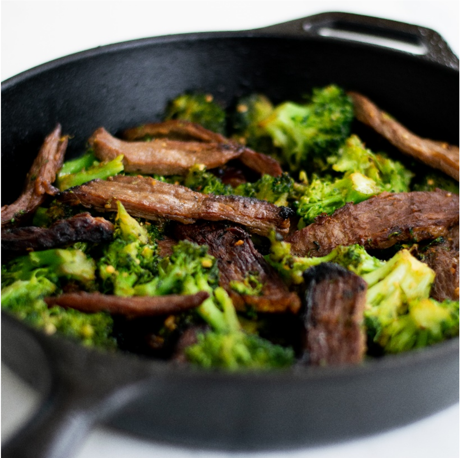
Beef and Broccoli