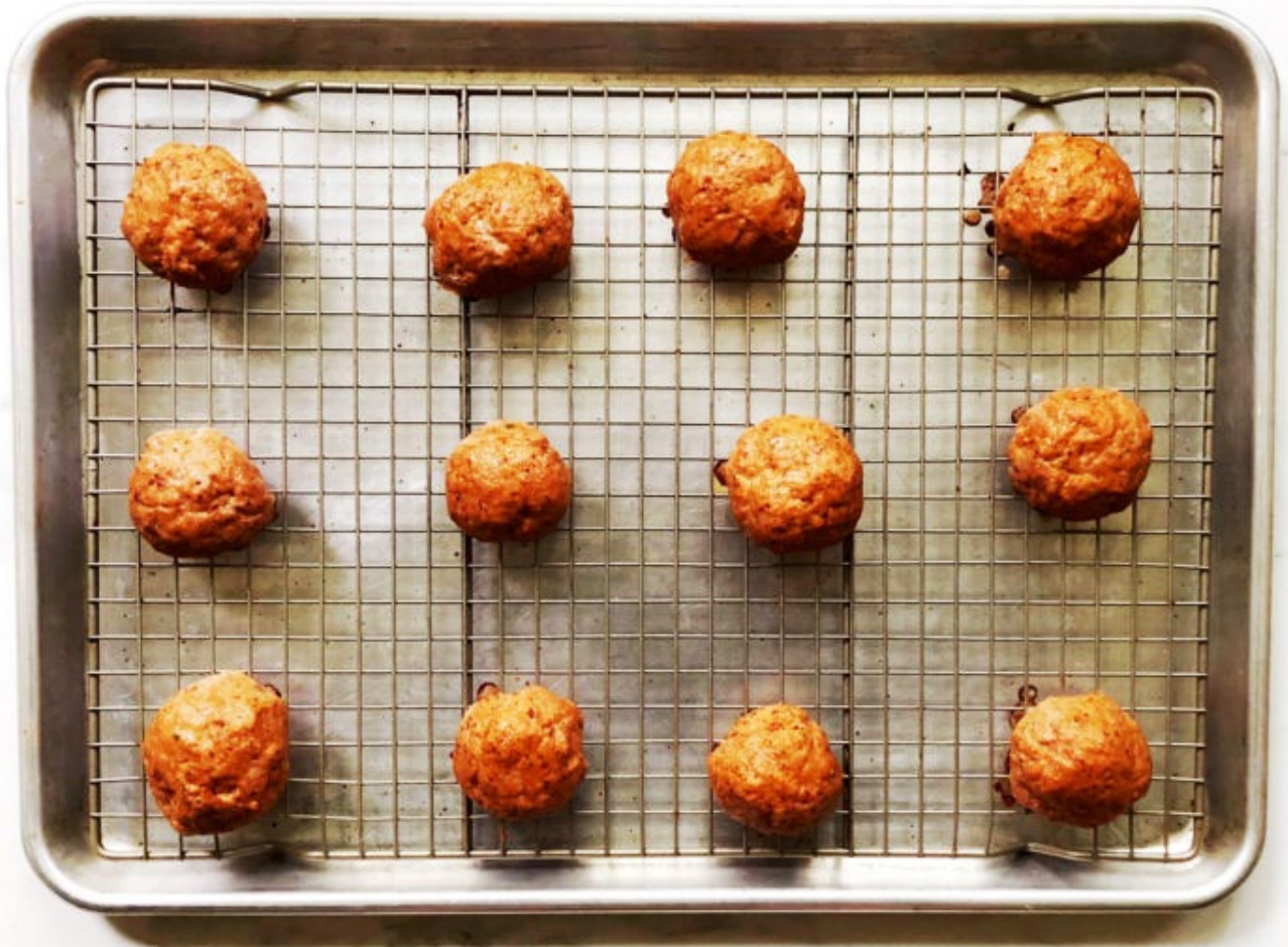
Buffalo Chicken Meatballs