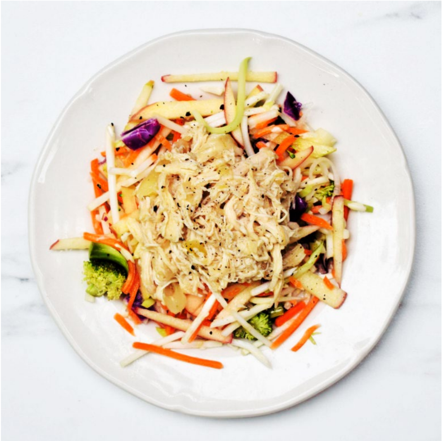
Slow Cooker Chicken with Apple Slaw