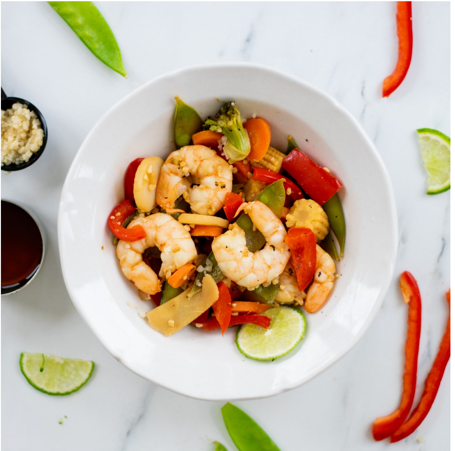
Shrimp Stir Fry