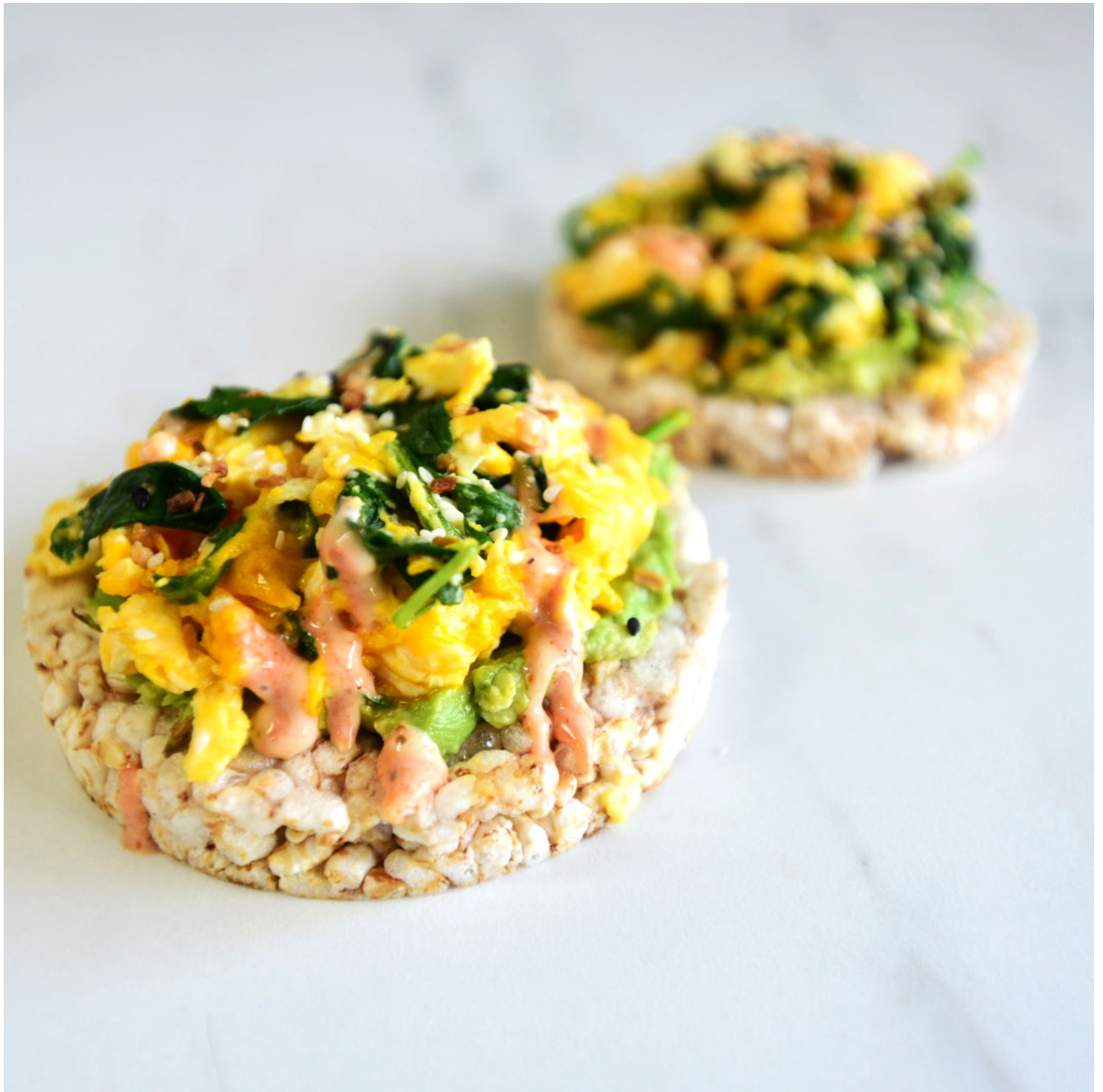
Breakfast Rice Cakes